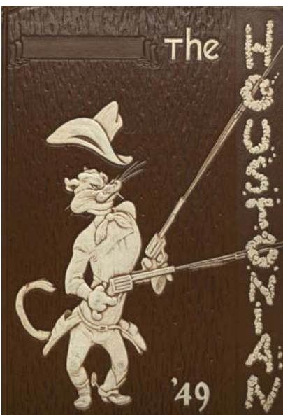
The 1949 Houstonian is one in a collection of University of Houston yearbooks in the UH Digital Library.